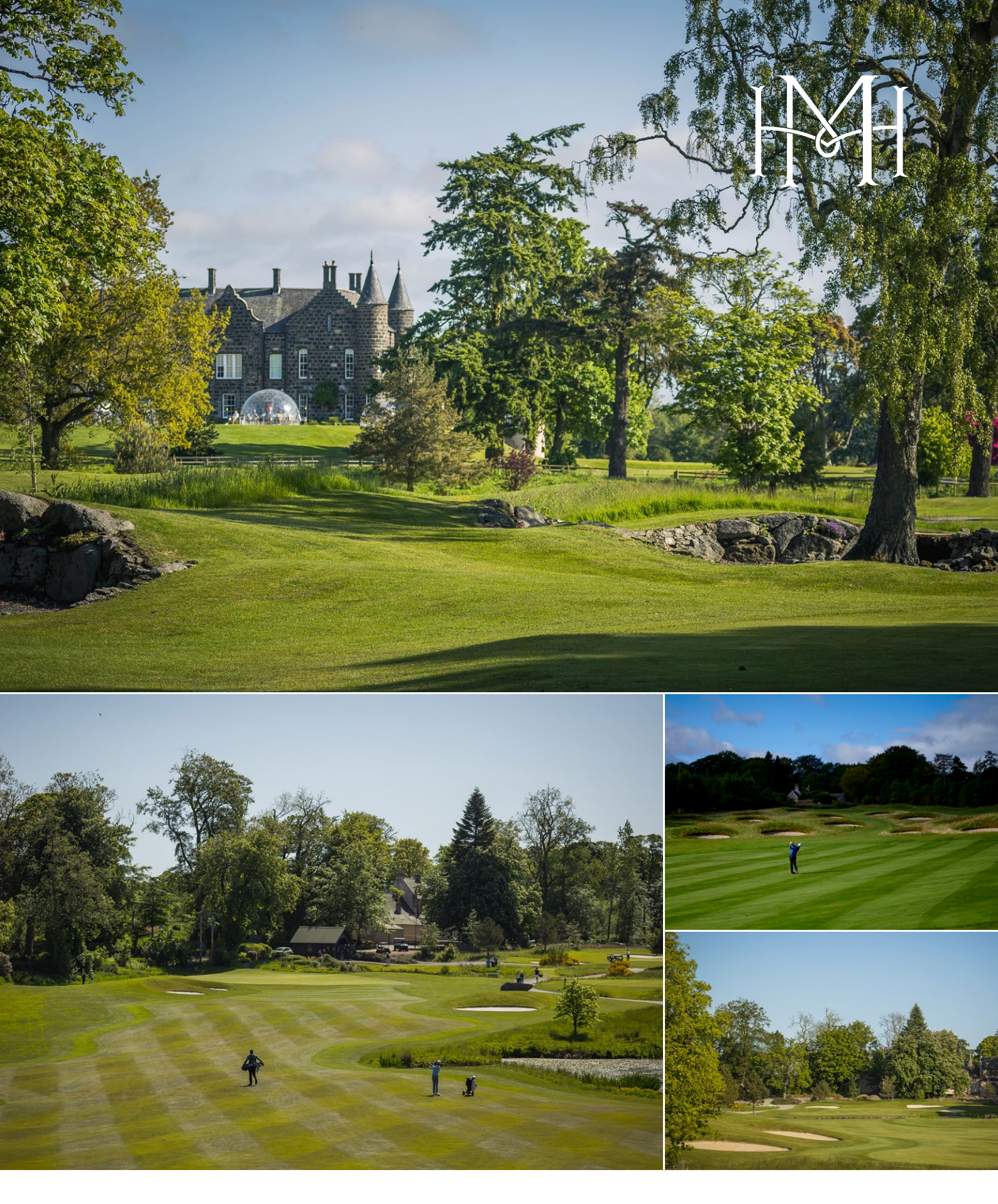
Golfing at Meldrum...